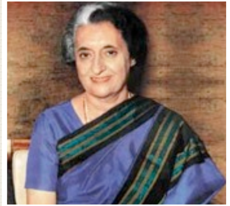
INDIRA GANDHI WAS THE FIRST WOMAN PRIME MINISTER OF INDIA FROM 1980 TO 1984

The women on this page are just a few of the inspirational Indian women who have had an influence all over the world.